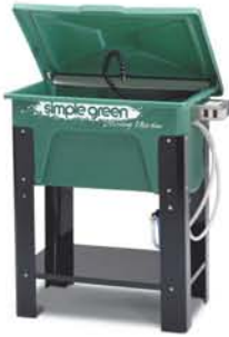
30-GALLON UNIT #79130