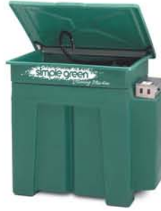
60-GALLON UNIT #79260