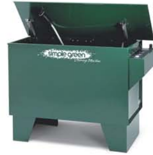
80-GALLON UNIT #79180